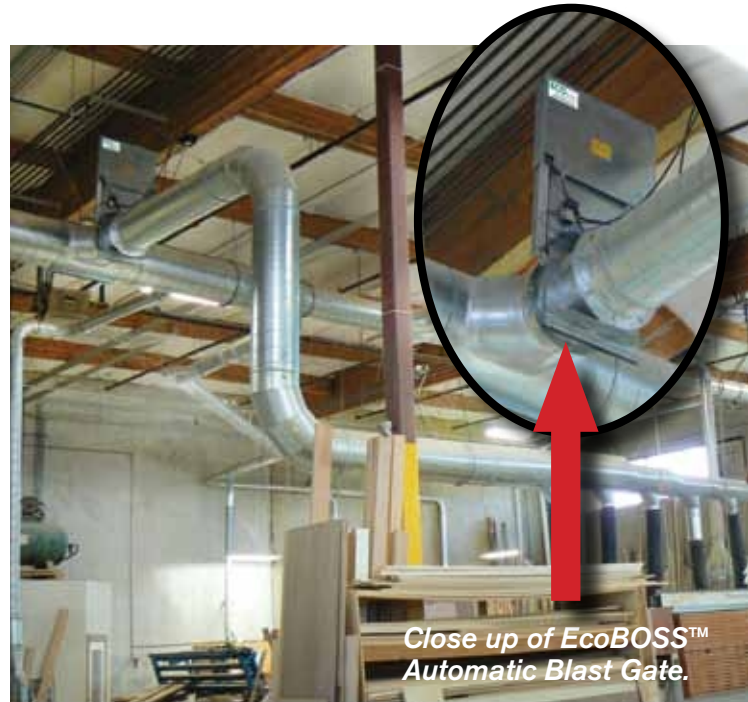
Close up of EcoBOSS™ Automatic Blast Gate.