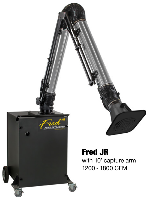
Fred JR with 10' capture arm 1200 - 1800 CFM