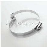
Car-Grip hose clamp, screwable