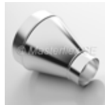
Hose reducer, symmetrical