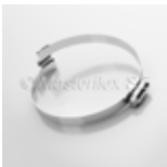
Clip-Grip hose clamp, screwable