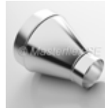
Hose reducer, symmetrical