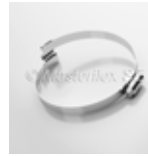
Clip-Grip special hose clamp