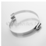
Clip-Grip hose clamp, screwable