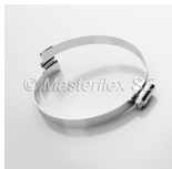
Master-Grip hose clamp, screwable