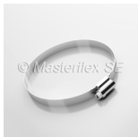
Hose clamp with worm-gear drive