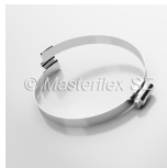
Car-Grip hose clamp, screwable