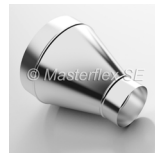
Hose reducer, symmetrical

Total Air/Energy SOLUTIONS Technology • Efficiency • Performance