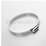
Hose clamp with worm-gear drive