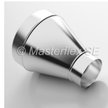
Hose reducer, symmetrical