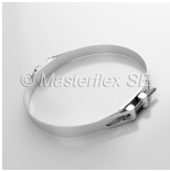
Hose clamp, bolt clamp