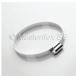
Hose clamp with worm-gear drive