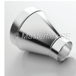
Hose reducer, symmetrical